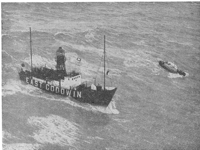
The Walmer Life-boat (C.S. No. 32) stands by the East Goodwin Lightship

The coxswain of the Walmer boat, Mr. E. Upton, reported that the boat nearly capsized at one time, when a particularly heavy sea washed