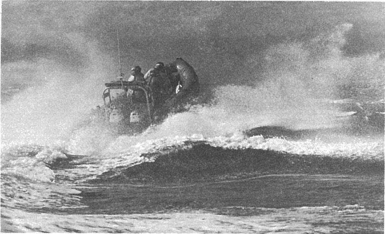
Atlantic 21 Inshore Life-Boat